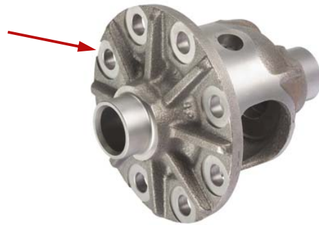
Differential casing (automobile)